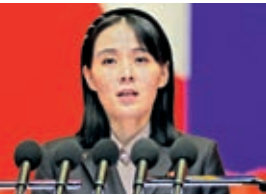
Kim Yo Jong

Last year, Kishida said he was willing to meet Kim “without any conditions”, saying Tokyo was willing to resolve all issues, including the abduction by North Korean agents of Japanese citizens in the 1970s and 1980s, which remains an