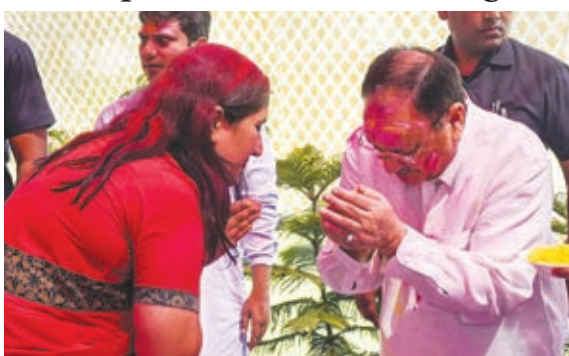
BJP national president J.P. Nadda with party candidate for Lok Sabha elections Bansuri Swaraj during Holi celebrations at his residence in New Delhi on Monday.

He reiterated his party's commitment to Punjab and the community. Mr Jakhar said the BJP's decision to go it alone in