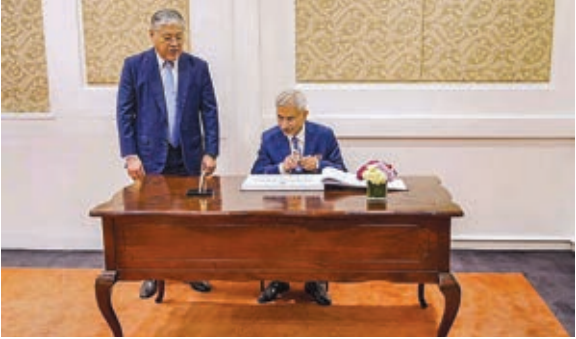
External affairs minister S. Jaishankar with secretary for foreign affairs of the Philippines Enrique Manalo during a meeting in Manila on Tuesday.

During his meeting with Philippine foreign minis-