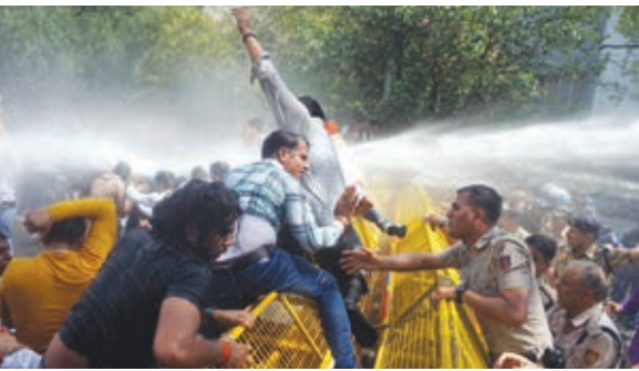
Security personnel use water cannon to disperse BJP workers during their protest in New Delhi on Tuesday against Delhi chief minister Arvind Kejriwal.

Zafar Marg when they tried to break through a layer of barricades," a police officer said. He said that about 57 BJP workers and leaders, including Delhi BJP president Virendra Sachdeva, were detained.