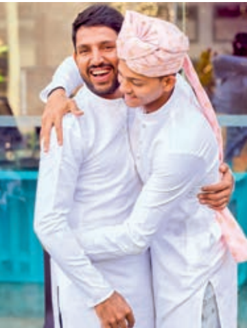
Rajasthan Royals players Dhruv Jurel (left) and Yashasvi Jaiswal in Indian attire to celebratae Holi.