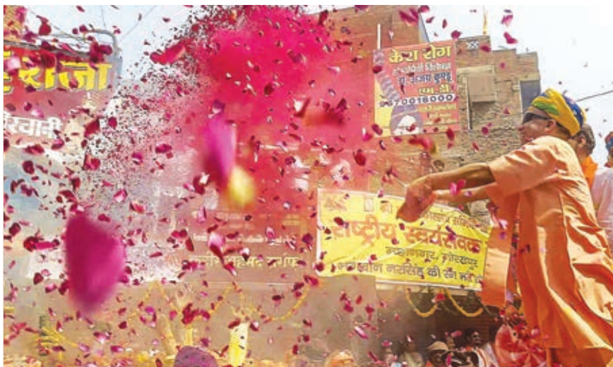
Uttar Pradesh chief minister Yogi Adityanath during Holi celebrations in Gorakhpur on Tuesday.

Mr Govil will be of great significance for the party's poll strategy. At this rally, sources said, BJP ally and RLD chief Jayant Chowdhary could also share the dais with the BJP leaders.