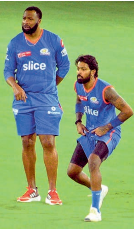
Mumbai Indians captain Hardik Pandya (right) and coach Kieron Pollard during a training session at the Rajiv Gandhi International Cricket Stadium in Hyderabad on Tuesday, eve of their match against Sunrisers Hyderabad.

the batting talk ends. Biggies Hardik and Tim David could only manage 11 each, with the latter pinned down at No. 7 in the line-up. For Mumbai's Tilak, it will be a home game, having grown up playing extensively on the ground he will take to on Wednesday. The Sunrisers appear to be in the same boat as Mumbai, batting wise. After fits and starts, they needed some serious hitting from Heinrich Klaasen to run the 208-run chase close before losing it all with just seven required off the last five balls. On the bowling front, big tag captain Pat Cummins will need to spearhead the SRH attack. Seasoned seamer Bhuvneshwar Kumar and Marco Jansen were not too impressive against KKR even as the promising Natarajan did well. Mumbai will also think of shuffling their bowling pack. Pushing pace ace Jasprit Bumrah upfront will be high on the list lest they end up being the butt of ridicule, like in their last outing.