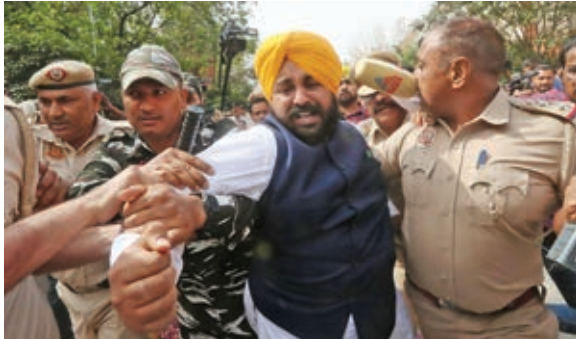
Security personnel detain Punjab minister and AAP leader Harjot Singh Bains during their protest outside Patel Chowk Metro station in New Delhi on Tuesday against the arrest of Arvind Kejriwal.

The Delhi CM was arrested on March 21 and subsequently remanded to the ED's custody.